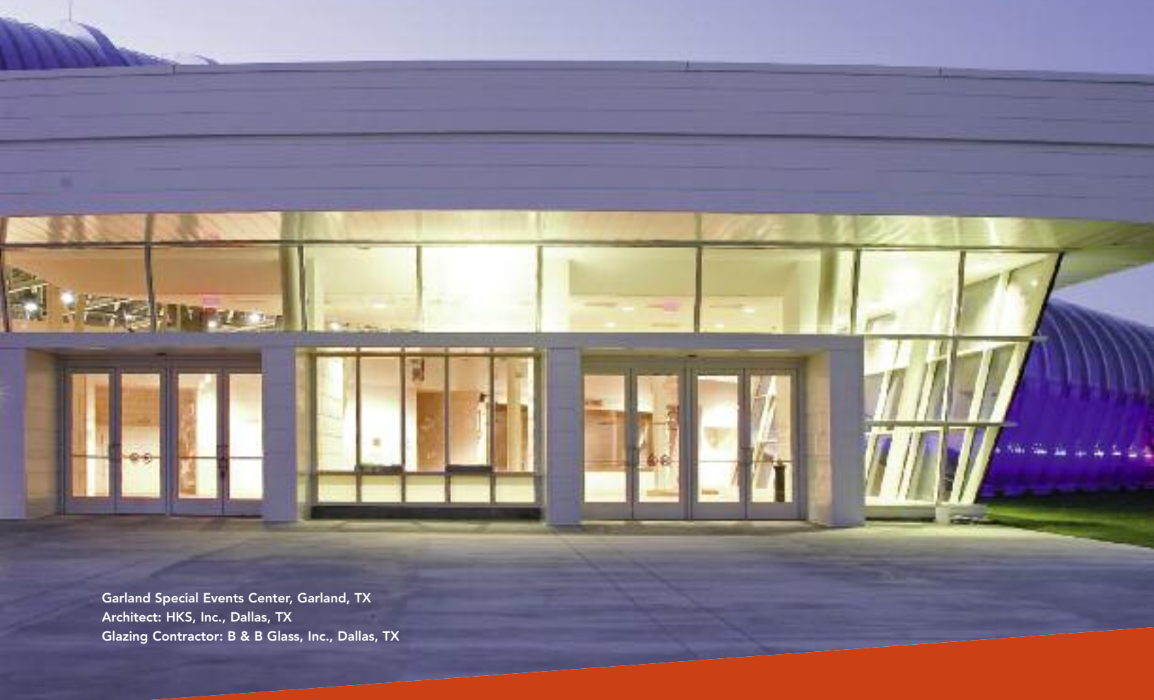
Garland Special Events Center, Garland, TX Architect: HKS, Inc., Dallas, TX Glazing Contractor: B & B Glass, Inc., Dallas, TX

Single Source Packages Generate Versatile First Impressions